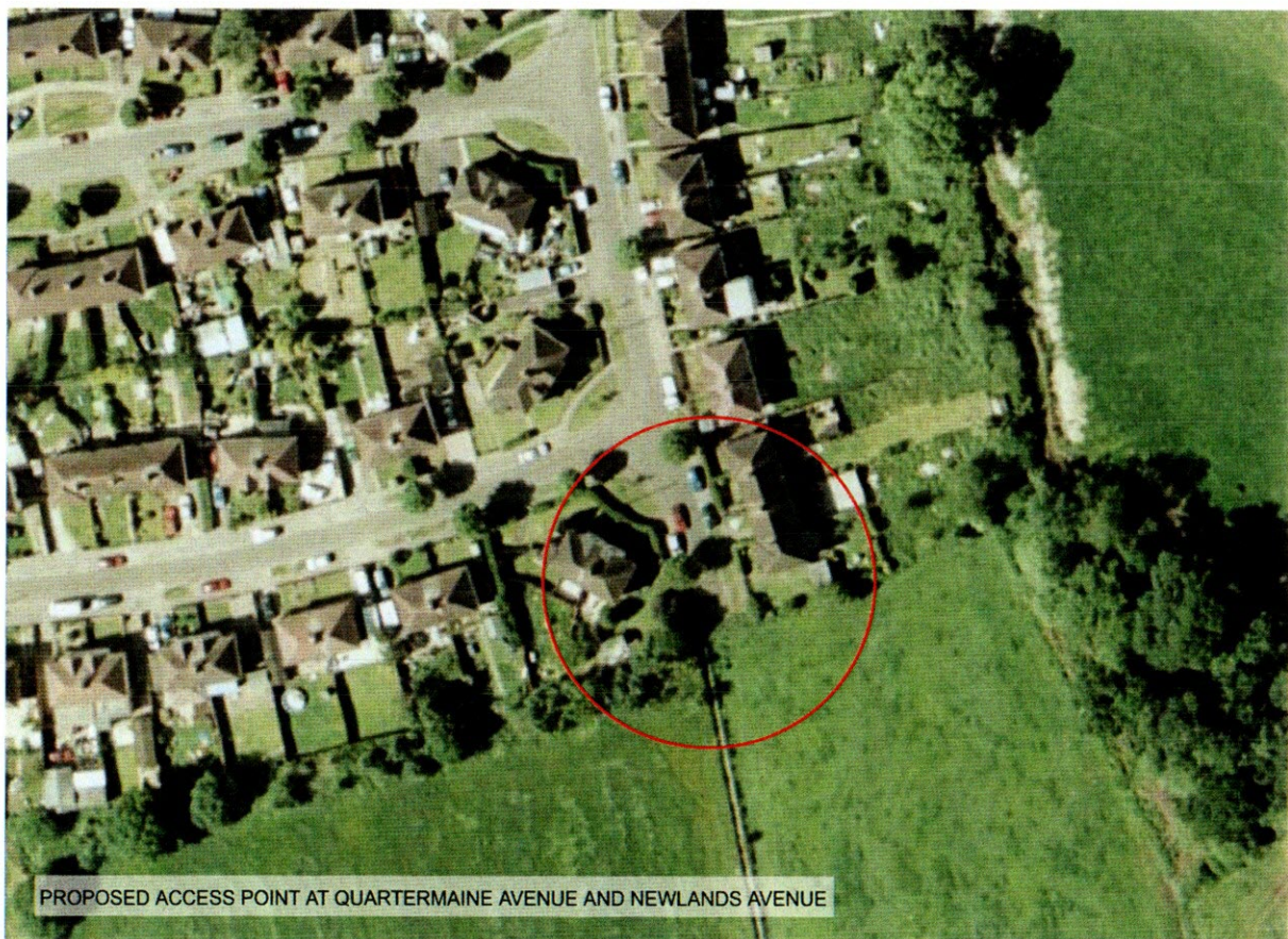
PROPOSED ACCESS POINT AT QUARTERMAINE AVENUE AND NEWLANDS AVENUE